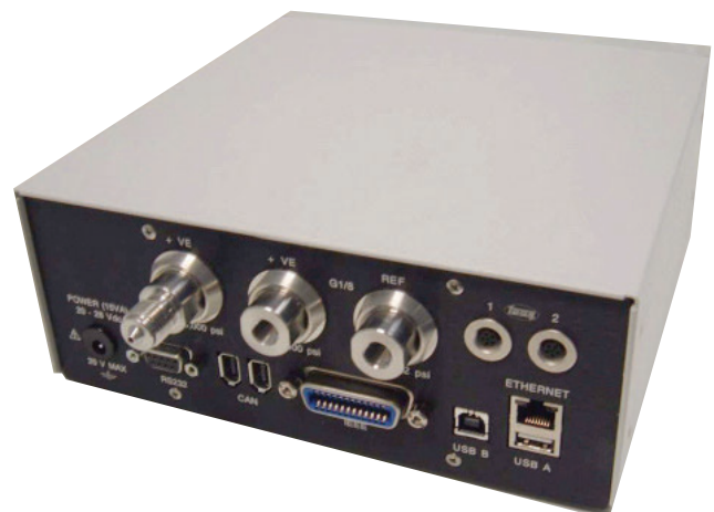
PACE1000 from the rear