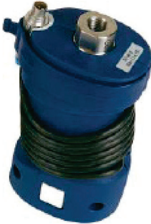
External IDOS universal pressure module

*Provides absolute pressure option in addition to gauge pressure. In absolute mode adds barometric pressure to gauge pressure range. For absolute mode ranges below 1 bar please consult your sales representative.