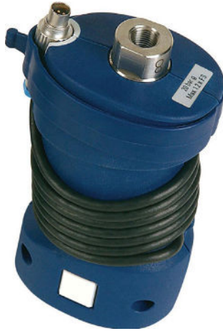
External IDOS universal pressure module

*Provides absolute pressure option in addition to gauge pressure. In absolute mode adds barometric pressure to gauge pressure range. For absolute mode ranges below 1 bar please consult your sales representative.