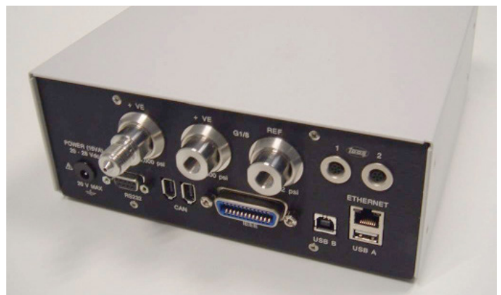
PACE1000 from the rear